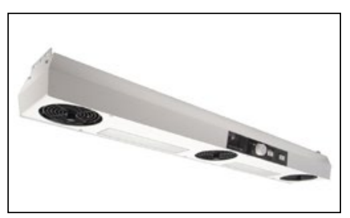
Figure 1. SCS 991A Overhead Air Ionizer