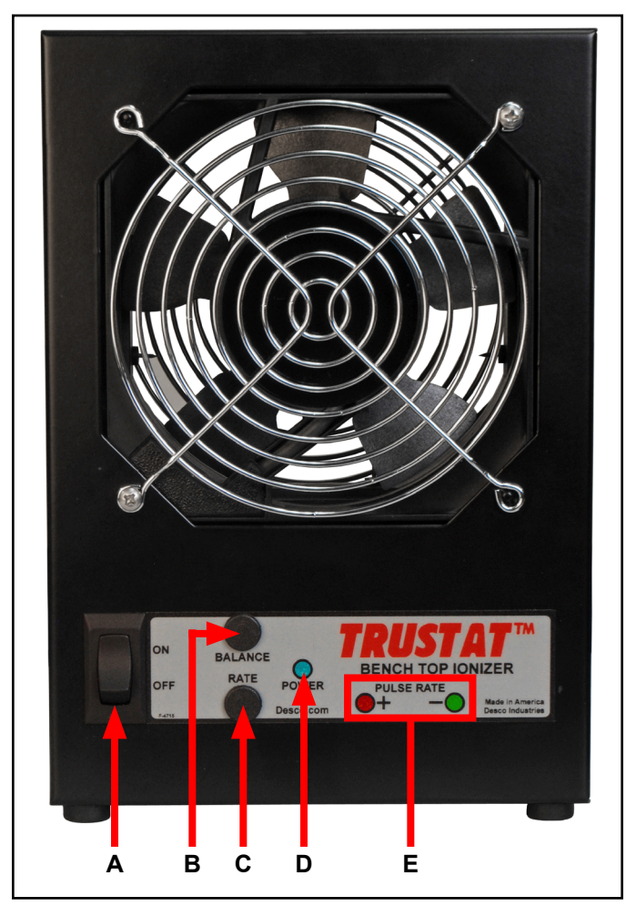
Figure 2. Trustat Bench Top Ionizer features and components