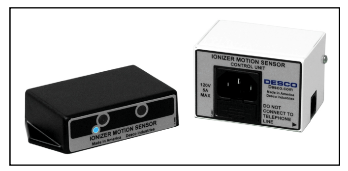
Figure 5. Desco 60509 Ionizer Motion Sensor

Desco offers the 60509 Desco Ionizer Motion Sensor as an accessory for your Trustat Bench Top Ionizer. Use it to activate your ionizer when an operator is present and deactivate it when the workstation is vacant. The Ionizer Motion Sensor conserves energy and reduces ionizer maintenance.