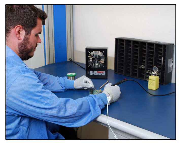
Figure 3. Using the Trustat Bench Top Ionizer at a workstation