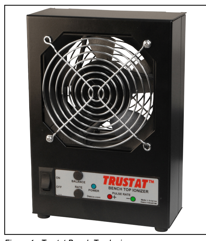
Figure 1. Trustat Bench Top Ionizer