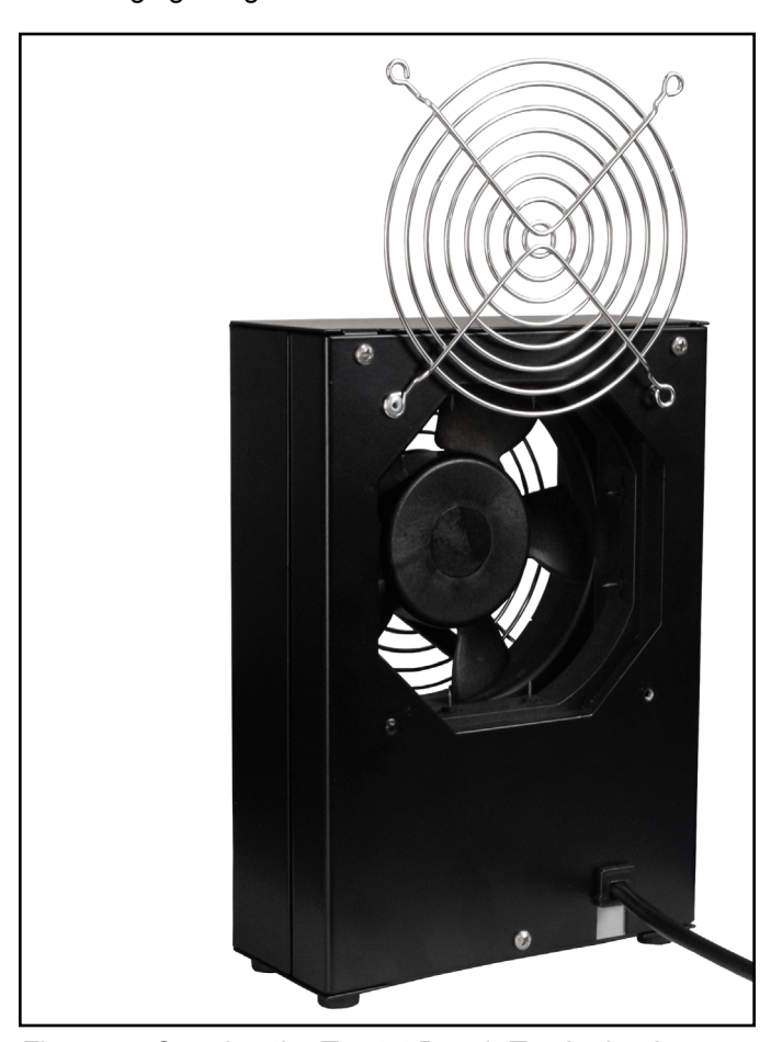
Figure 4. Opening the Trustat Bench Top Ionizer's rear screen in order to access the emitter points

Open the rear screen by loosening the screw and swinging the grill to one side.