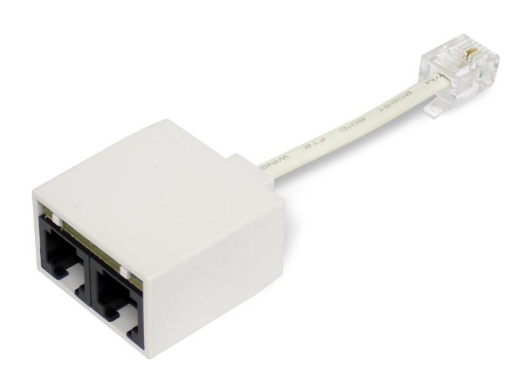
The in-line DSL nanoFILTER