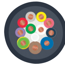
PUR/PVC black [PUR]