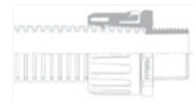
Conduit complete with FPA fitting