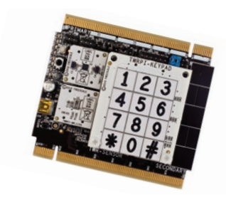
*Tower System module (black development board in image) not included with TWRPI-KEYPAD plug-in